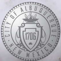
Martin J. Chávez, Mayor